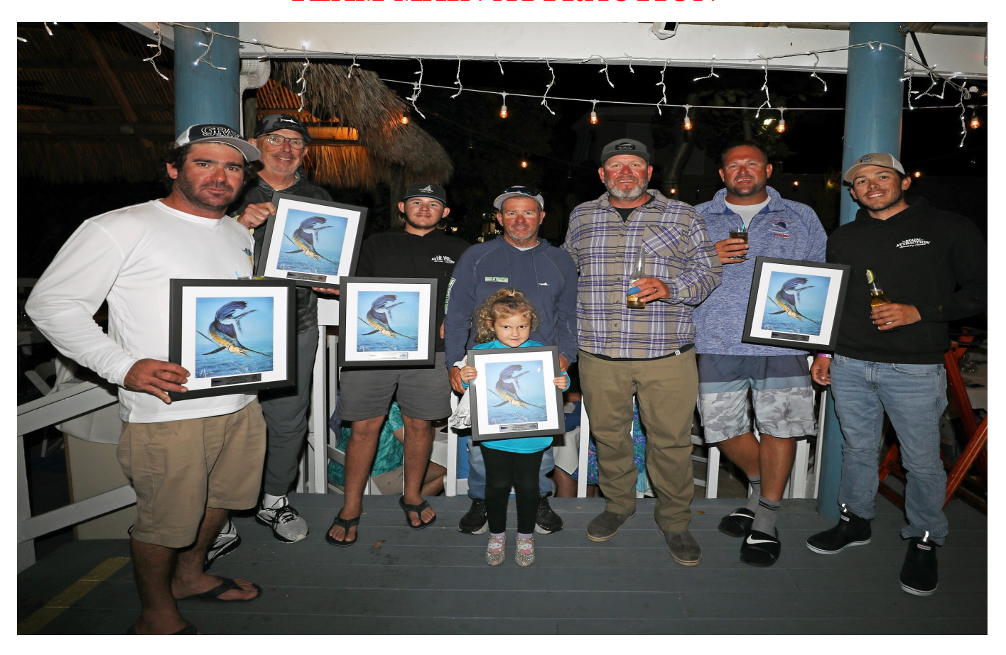
3RD PLACE TEAM KALEX